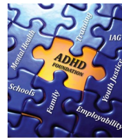
The missing piece of the puzzle