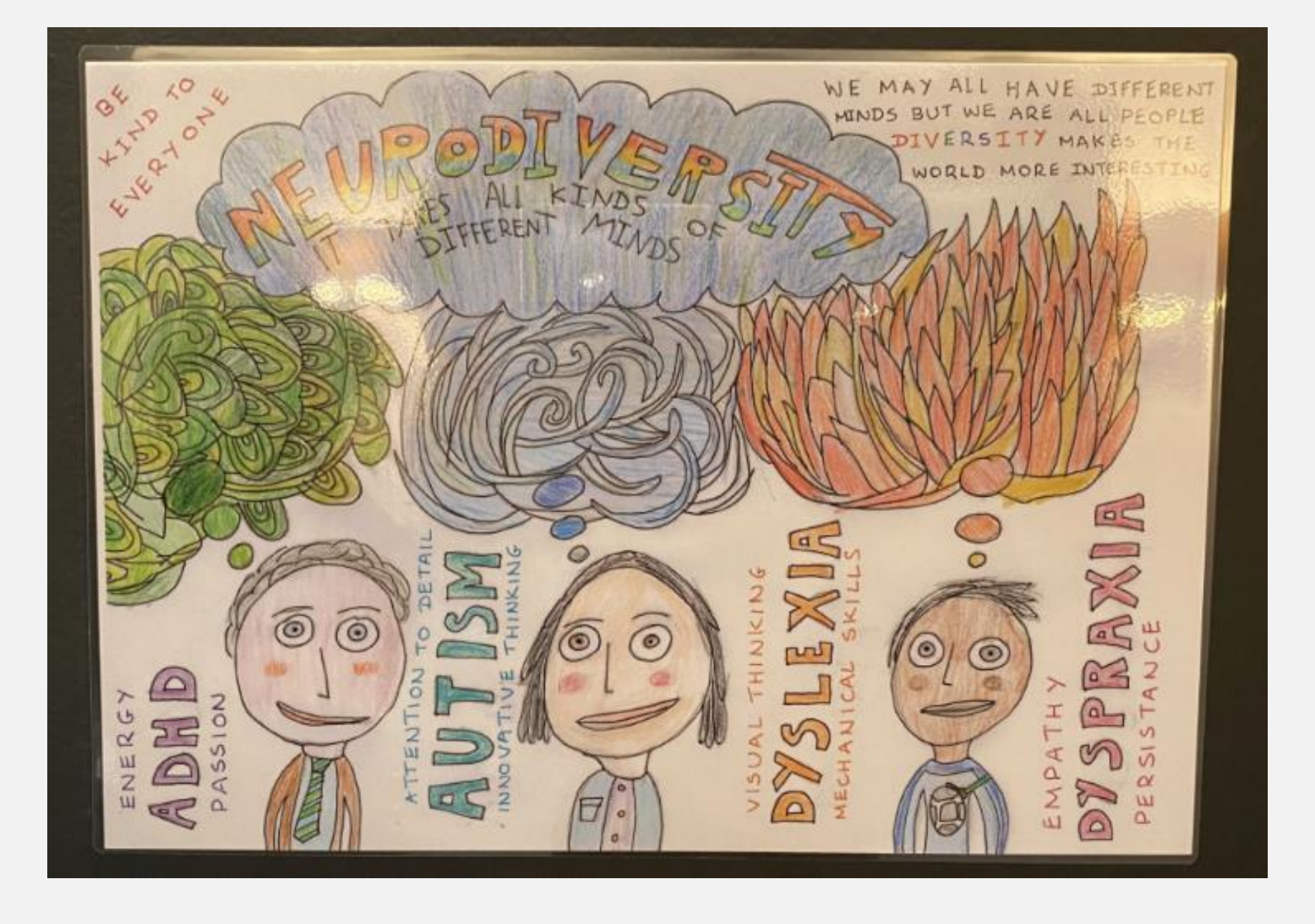
Winner of 2020 Neurodiversity Celebration Week Art Competition