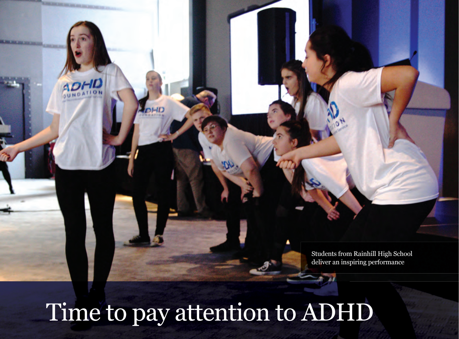
Students from Rainhill High School deliver an inspiring performance