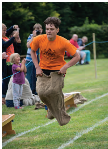
Sports day at Wilds Lodge School provides plenty of opportunities for aerobic exercise

The report also notes that a third of young people with ADHD had been temporarily excluded from school while waiting to see a specialist, while 51% of adults and children had experienced ‘a lack of recognition for ADHD as a real condition’ from frontline professionals including GPs, other specialists and school staff.