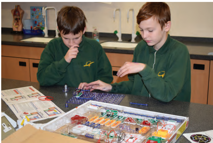
Two boys from Wilds Lodge School focus intently