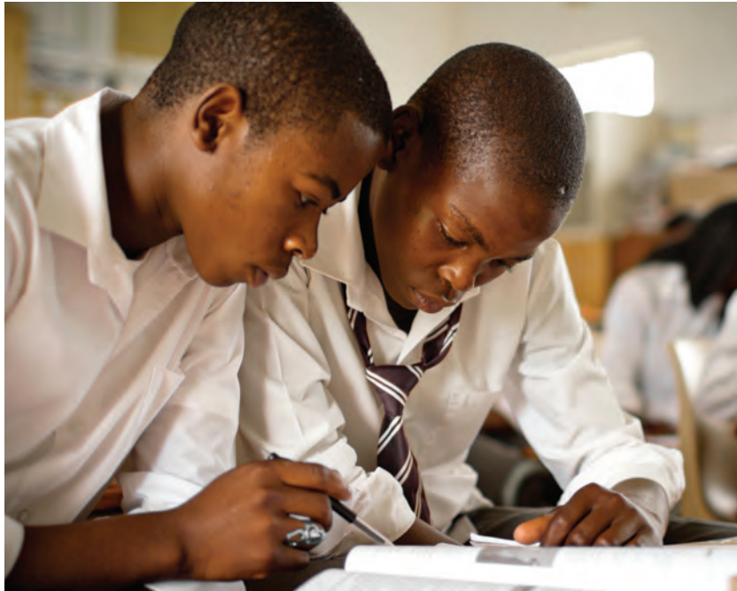
Seating the pupil next to a good role model or learning buddy helps them to engage and stay on task

You need to externalise what is not happening internally. Give the child